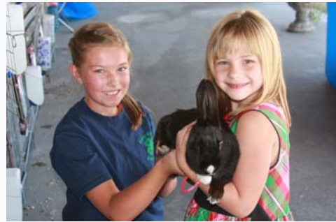
FUZZINESS 2015 LAKE COUNTY FAIR