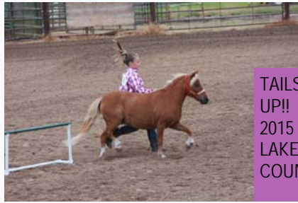
TAILS UP!! 2015 LAKE COUNTY