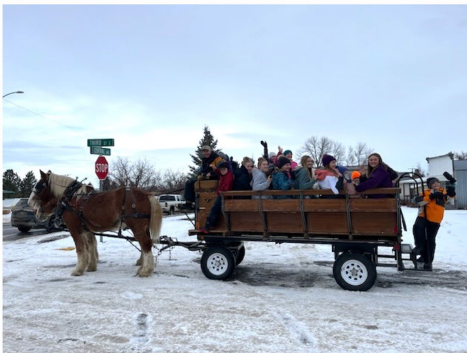
STANFORD SCRAMBLERS ENJOYING THE STANFORD CHRISTMAS STROLL

Judith Basin Co. 4-H has a new home on the web along with up-to-date information and resources. Find us at www.montana.edu/extension/judithbasin/