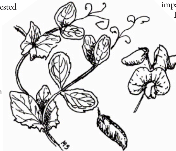
FIGURE 1. Dry pea ( Pisum sativum ) plant characteristics

As a general rule, peas require a higher level of weed management than more competitive crops such as wheat or barley. While not enough by themselves, cultural