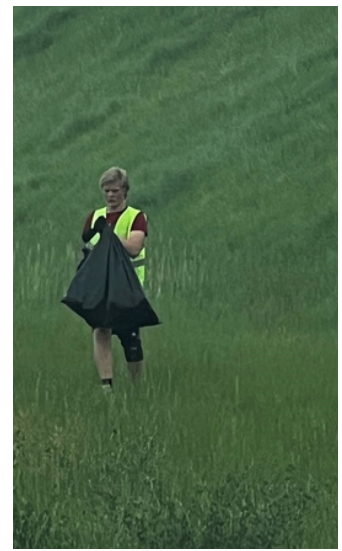
Curry Comb 4-H club teamed up with the Lions Club this summer for their annual highway cleanup. Great job, crew!