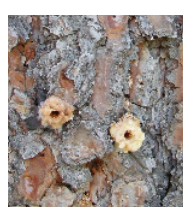
Figure 2 above: Scots pine tree mass attacked by thousands of beetles. At each entry point the tree exudes sap and pitch in an attempt to repel the beetle, producing distinctive "pitch tubes". Each pitch tube represents a point of entry where a single beetle chewed trough the bark.