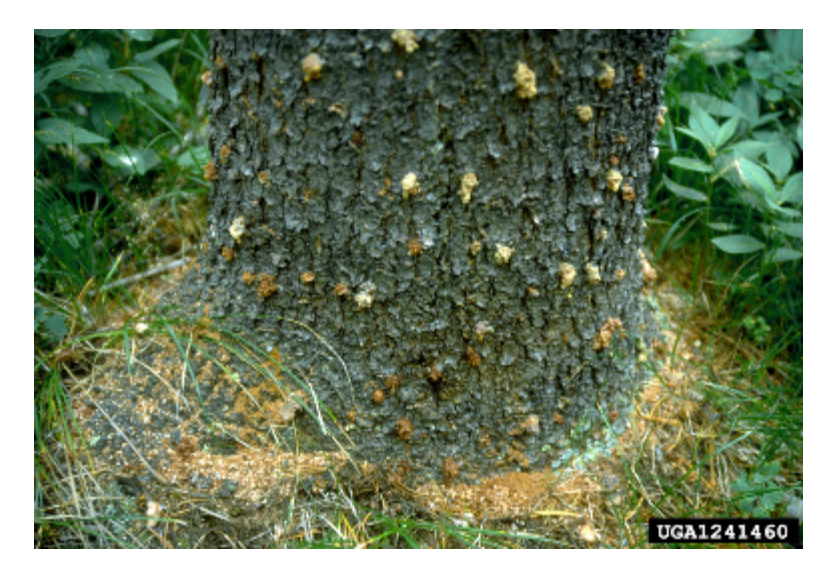
Figure 3 above: Trees may not always produce pitch tubes, particularly drought stressed trees that have less sap. Boring dust at the base of the tree is another sign of infestation. As the adult beetles chew and construct galleries underneath the bark they push out the dust. With hundreds of beetles at work, boring dust accumulates at the base of the tree, looking something like sawdust. Boring dust is a sign of an active infestation.