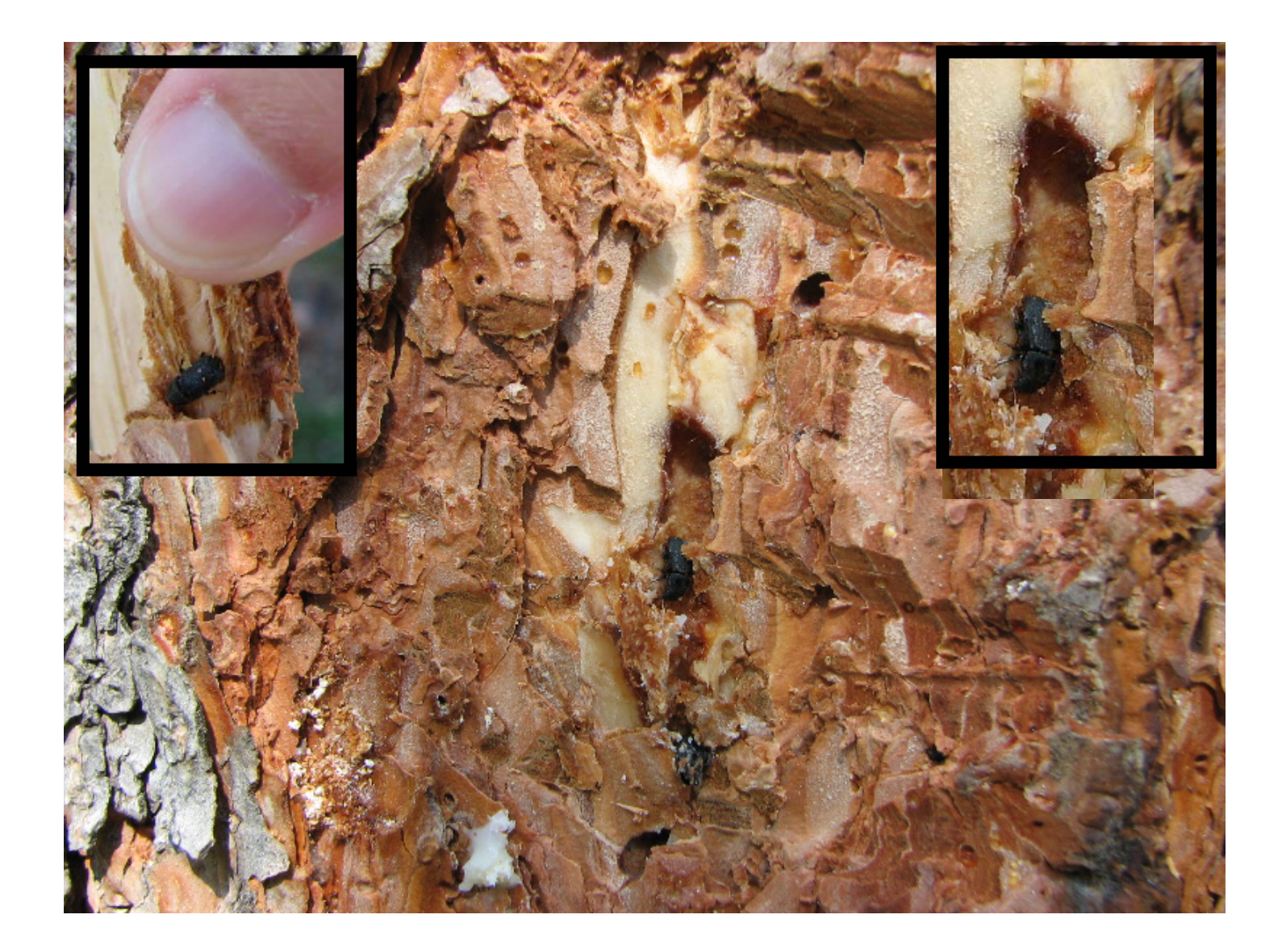
Figure 6 : Adult mountain pine beetles under the bark of a Scots pine tree. These are tiny beetles not much larger than a grain of rice.