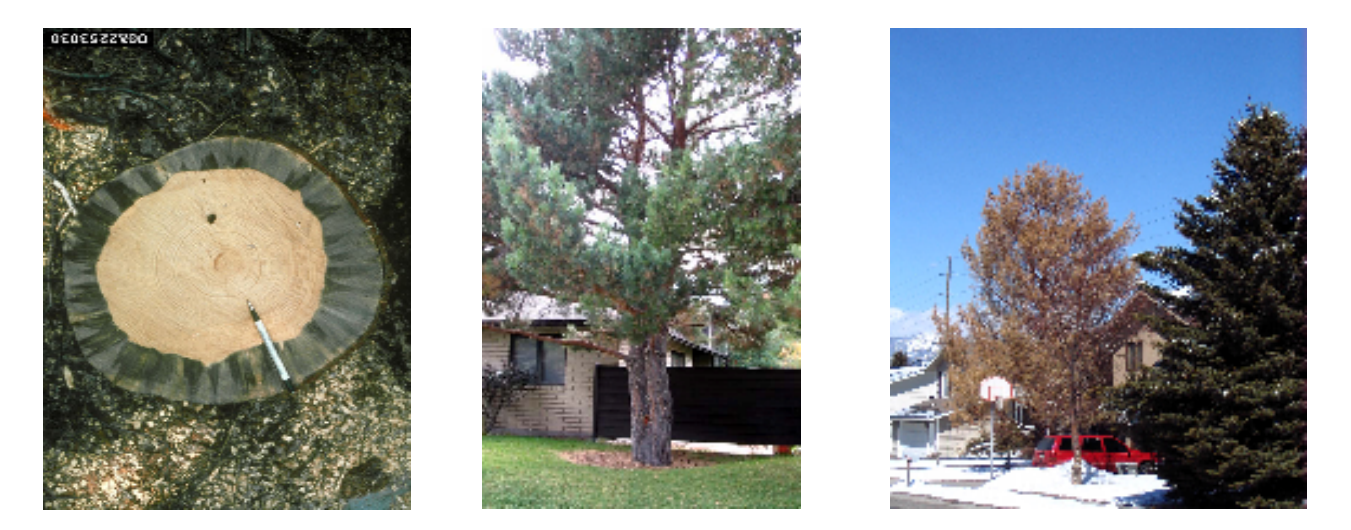
Figure 5 above.

As mountain pine beetles bore into a tree, they bring with them blue stain fungi that colonize the tree. The blue stain commonly seen on pinewood lumber or furniture is caused by blue stain fungi. The fungi invade the inner bark as well as the sapwood of the tree trunk The picture above left is a cross section of pine tree with blue stain fungi growing towards the center. It is the combined action of the beetle feeding and the stain fungi that girdles and kills the tree. Although mass attacked trees will stay green over the winter (center picture) much like a Christmas tree, the damage has been done. The tree is girdled, and when temperatures rise in the spring, mass attacked trees will begin to turn yellow and die from lack of water and nutrients (right-side picture). Despite the snow on the ground, the picture above right was taken during April 2009.