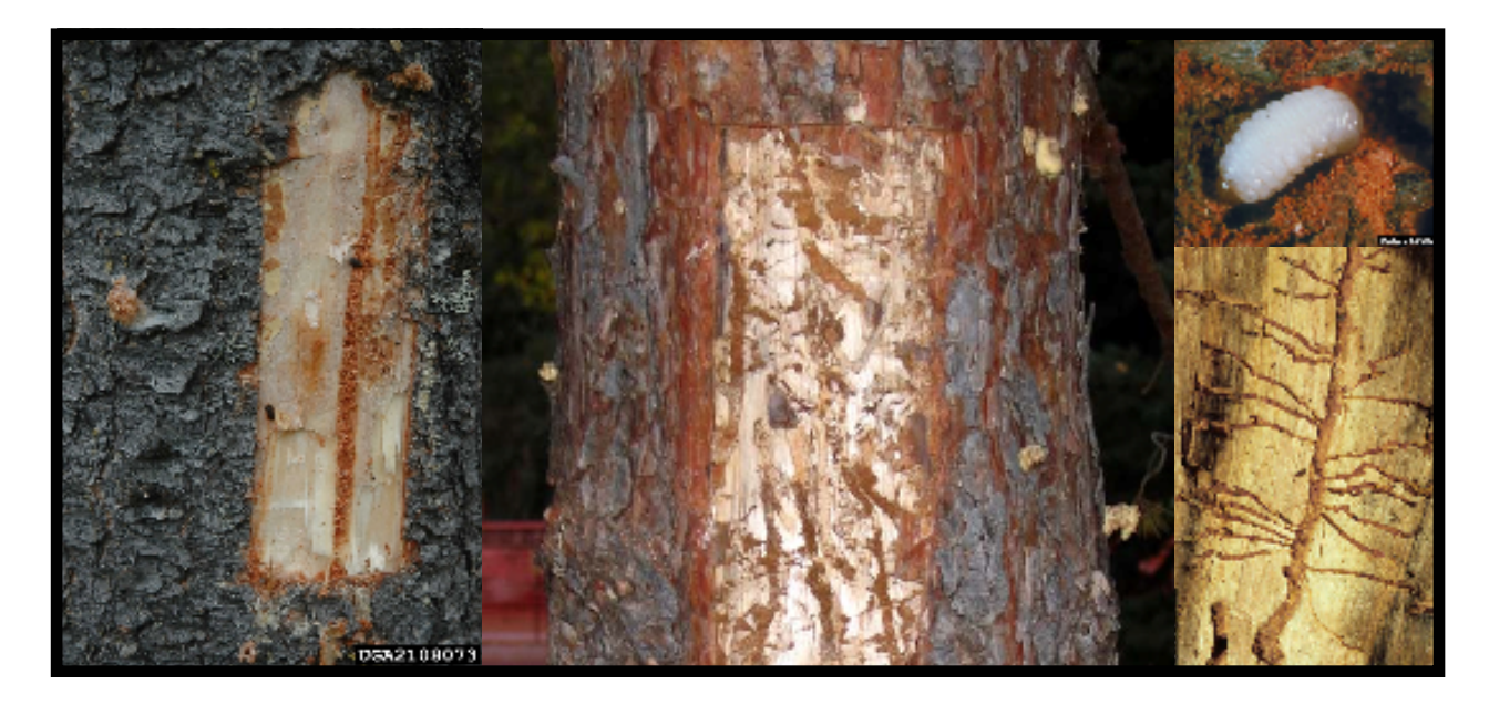
Figure 4 above: Left, after boring through the bark, female beetles construct a vertical gallery underneath the bark. When a tree is attacked by hundreds of beetles, the inner bark is destroyed by their feeding activity (middle picture). After mating, female beetles lay eggs along the vertical gallery. The eggs hatch into small grub-like larvae (upper right) that feed in a horizontal direction. The smaller larval feeding galleries radiating out from the larger vertical gallery produced by the adults produces a characteristic pattern underneath the bark (lower right hand corner).

Figure 3 above: Trees may not always produce pitch tubes, particularly drought stressed trees that have less sap. Boring dust at the base of the tree is another sign of infestation. As the adult beetles chew and construct galleries underneath the bark they push out the dust. With hundreds of beetles at work, boring dust accumulates at the base of the tree, looking something like sawdust. Boring dust is a sign of an active infestation.