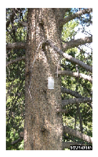
Figure 8 : The repellent pheromone verbenone is sold as liquid pouches that are attached to the tree trunk. In forests vebenone is spaced and applied in a grid pattern. In urban settings, high value pine trees are protected by applying two pouches per tree at the end of June, before the first of July.

USDA Forest service research has found that two pouches of verbenone applied to each pine tree at the end of June protected 80% or more of the trees that were treated (see "verbenone report" link). Please note that these recommendations are for protecting small numbers of high value trees. Recommendations for deploying verbenone in forest and woodlot settings are based on numbers of pouches per acre of forest, please refer to the DNRC Forestry Division website (http://dnrc.mt.gov/forestry/Assistance/Pests/mtnpinebeetle.asp).